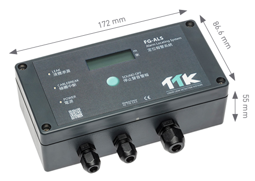
FG-ALS Wall Mounted Unit